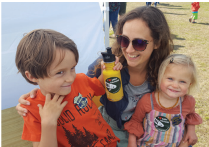
Festival attendees show off their KHLT I Love Baby Salmon stickers during the 2019 Kenai River Fest in Soldotna

Consider giving ahead to future generations by including the Land Trust in your estate plans.