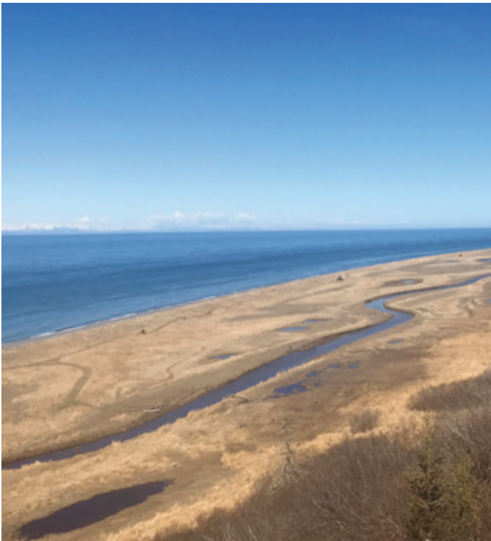
KHLT's Stariski Estuary

The protection of this important spawning and rearing habitat will serve as a valuable addition to the overall health of the salmon and steelhead population in the Anchor River for generations to come. ✦