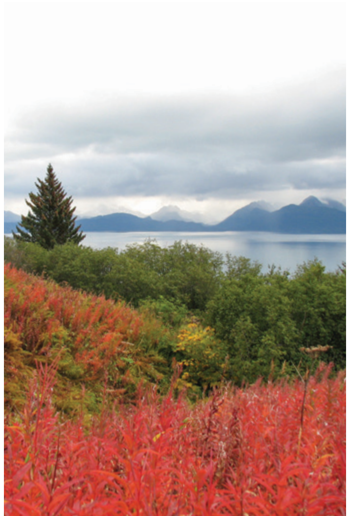
KHLT's Cutting Preserve property overlooks Kachemak Bay

H omer Wilderness Leaders (HoWL) spent a few beautiful days this summer working hard to complete some much-needed repairs on our Calvin and Coyle Nature Trail. With funding through a Recreational Trails Program grant from the State of Alaska, the HoWL DiRtBaG (Discount Rates for Boys and Girls) scholarship participants replaced rotting sections of boardwalk through wetland areas and cleared brush for a safer and more welcoming trail experience. We appreciate the hard work of HoWL to educate youth about the conservation of wild and recreational lands while encouraging a lifetime of stewardship and appreciation of our treasured Alaskan wilderness. Thanks for helping, HoWL – see you on the trail! ✨