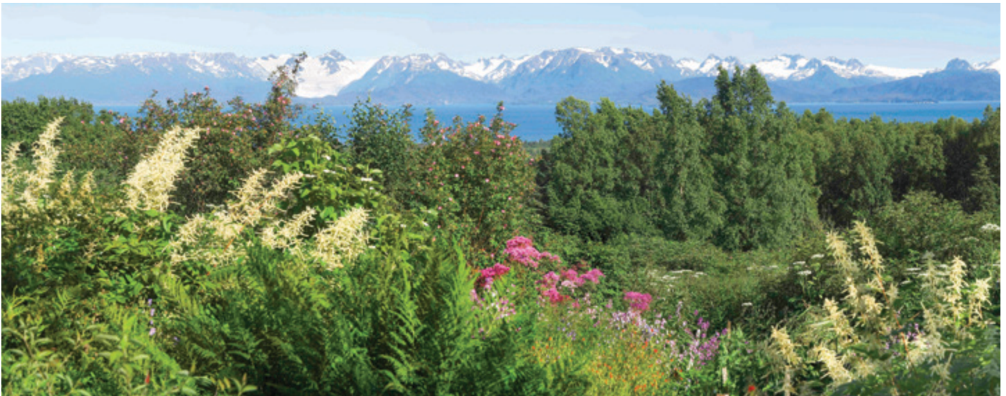
The view from the late Toby Tyler's donated tradeland property located east of Homer. KHLT sold the property in 2019 with a conservation easement in place, protecting the property's important wildlife habitat forever.