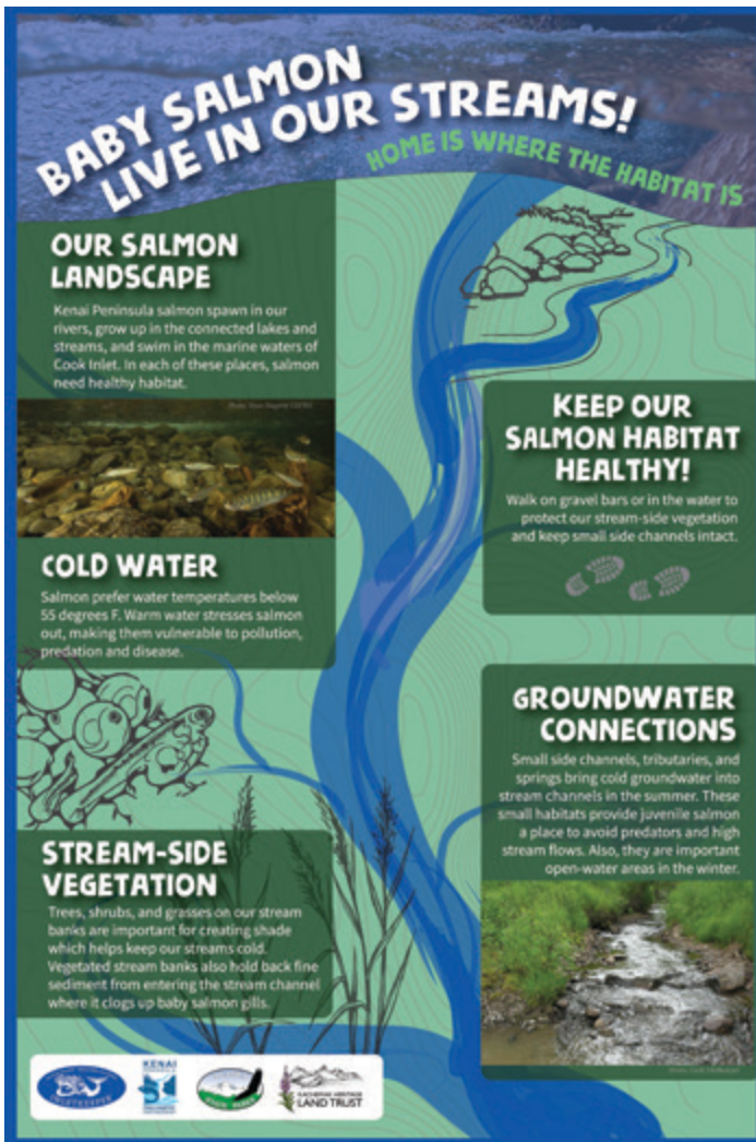
New habitat-focused sign