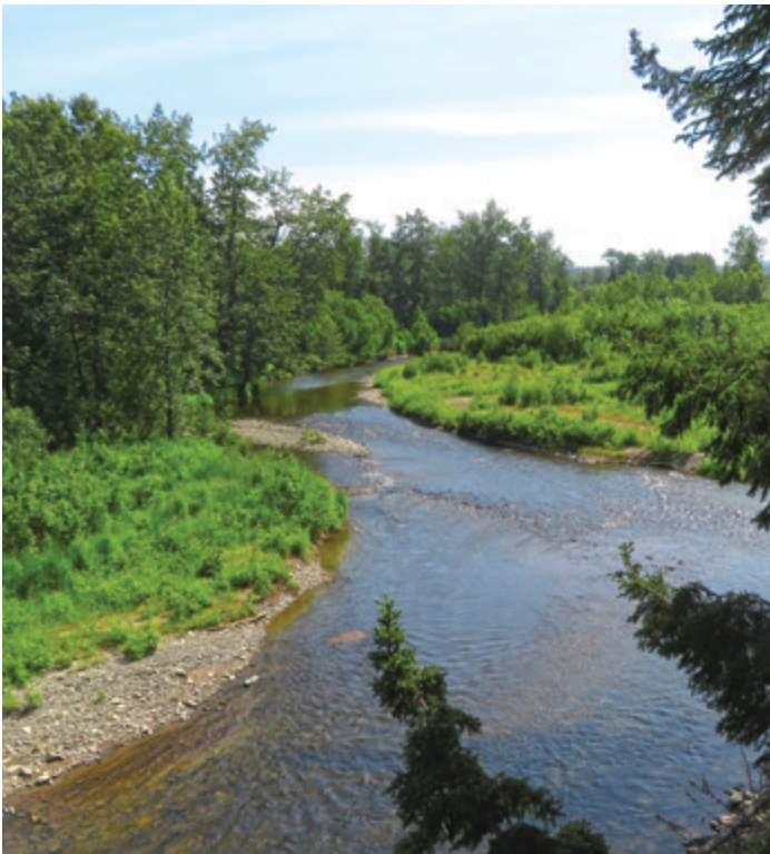
KHLT's newly acquired property on the Anchor River has over 1,000 feet of streambank