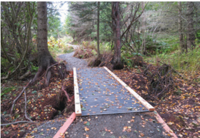
The first phase of KHLT's new Americans with Disabilities Act accessible trail is complete

KHLT has been working with the City of Homer, the Homer Independent Living Center, and Alaska State Parks, and worked with the National Park Service's Recreational Trails program and U.S. Fish and Wildlife Service to build the trail. Stay tuned as this wonderful community project develops. ✧