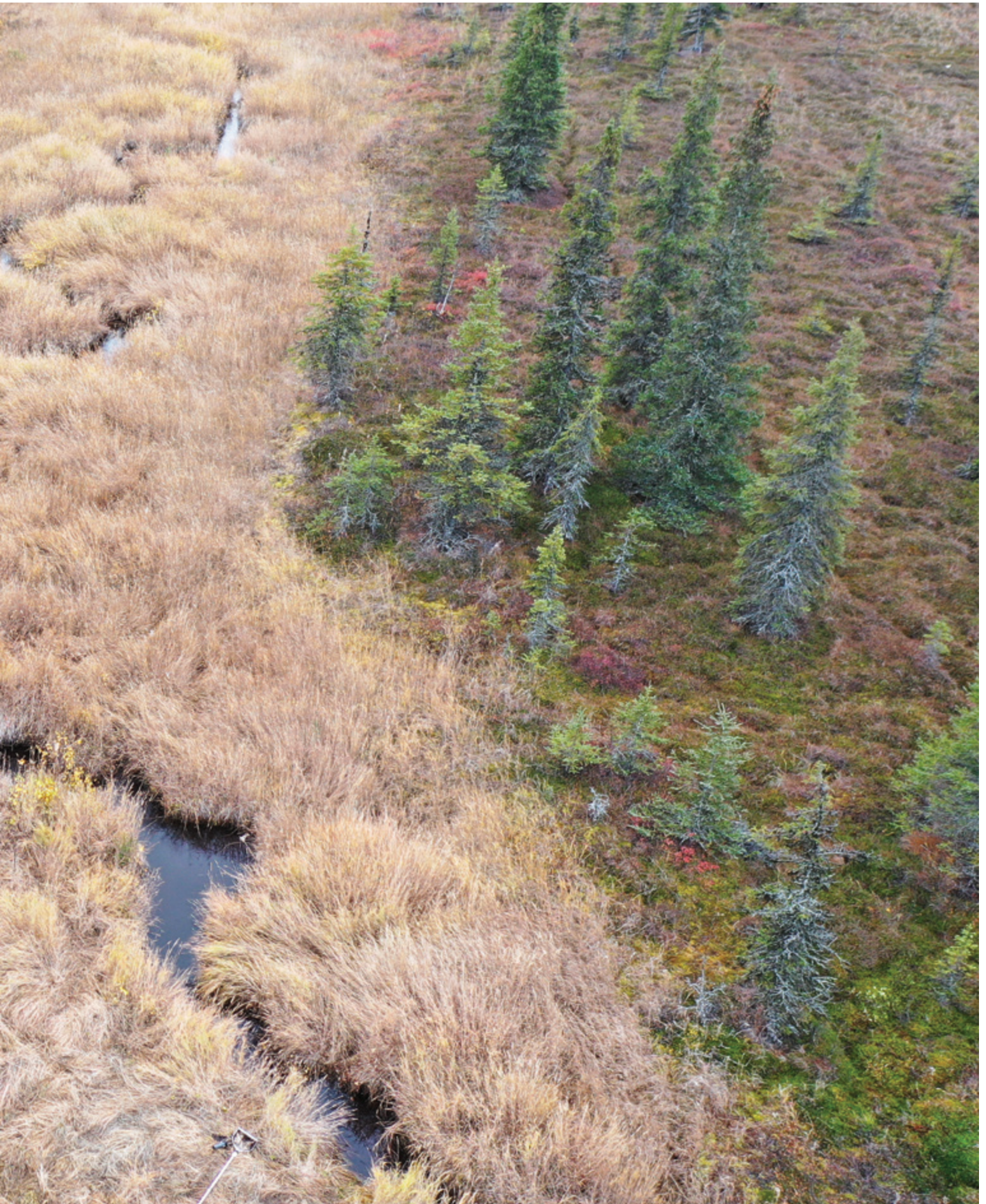
Aerial view of the Fish Need Land Too field trip site in Anchor Point. Yes, this is salmon habitat!