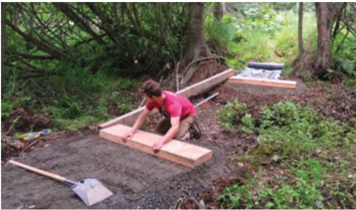
Ptargamin P Trails staff builds phase 1 of KHLT's Universal Poopdeck Community Park Trail