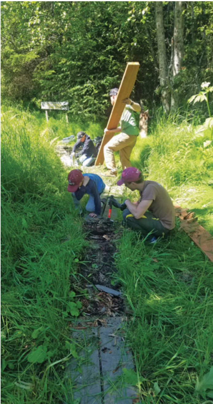
HoWL repairing Calvin and Coyle Nature Trail